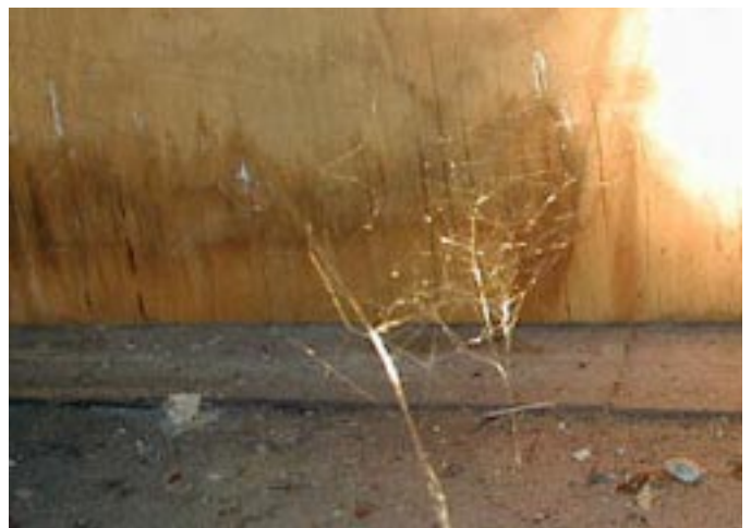
Evidence Of Past Water Presence In Basement.