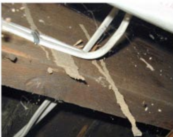
Termite Shelter Tubes And Termite Damage To Floor Joist.