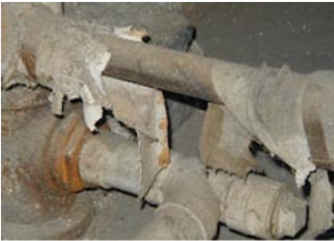
Damaged Suspect Asbestos Material.