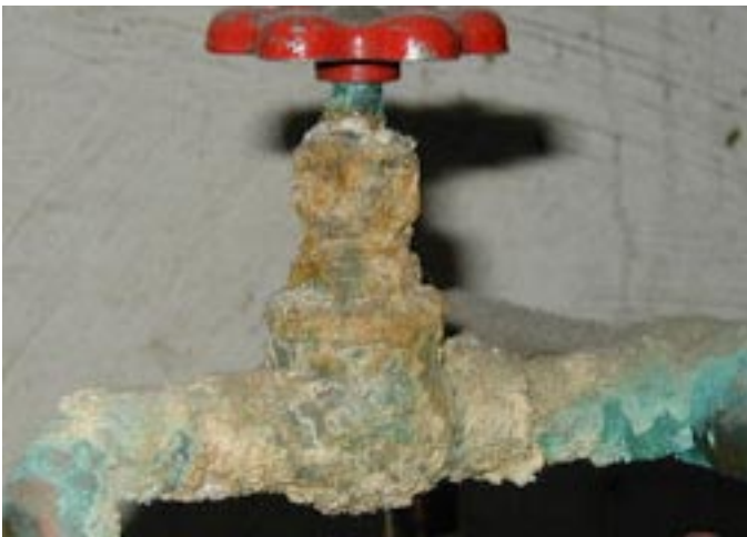
Severely Corroded Water Shut Off Valve.