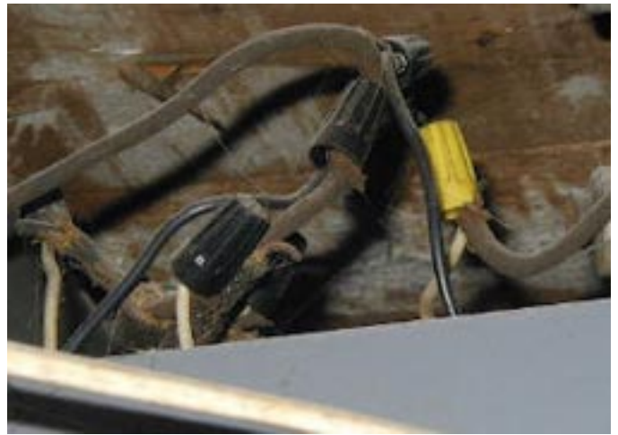
Old Knob And Tube Wiring.